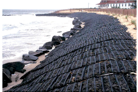
Cape May, New Jersey circa 1997

Tensar International Corporation 2500 Northwinds Parkway Suite 500 Alpharetta, GA 30009 800-TENSAR-1 tensarcorp.com