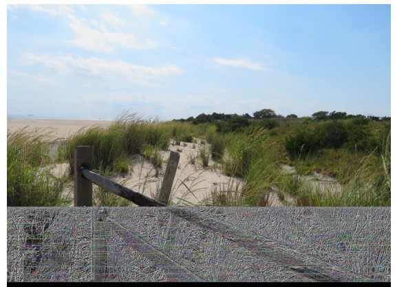
Cape May, New Jersey 2019